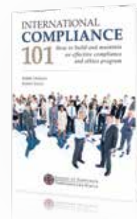
International Compliance 101, (normally $60)